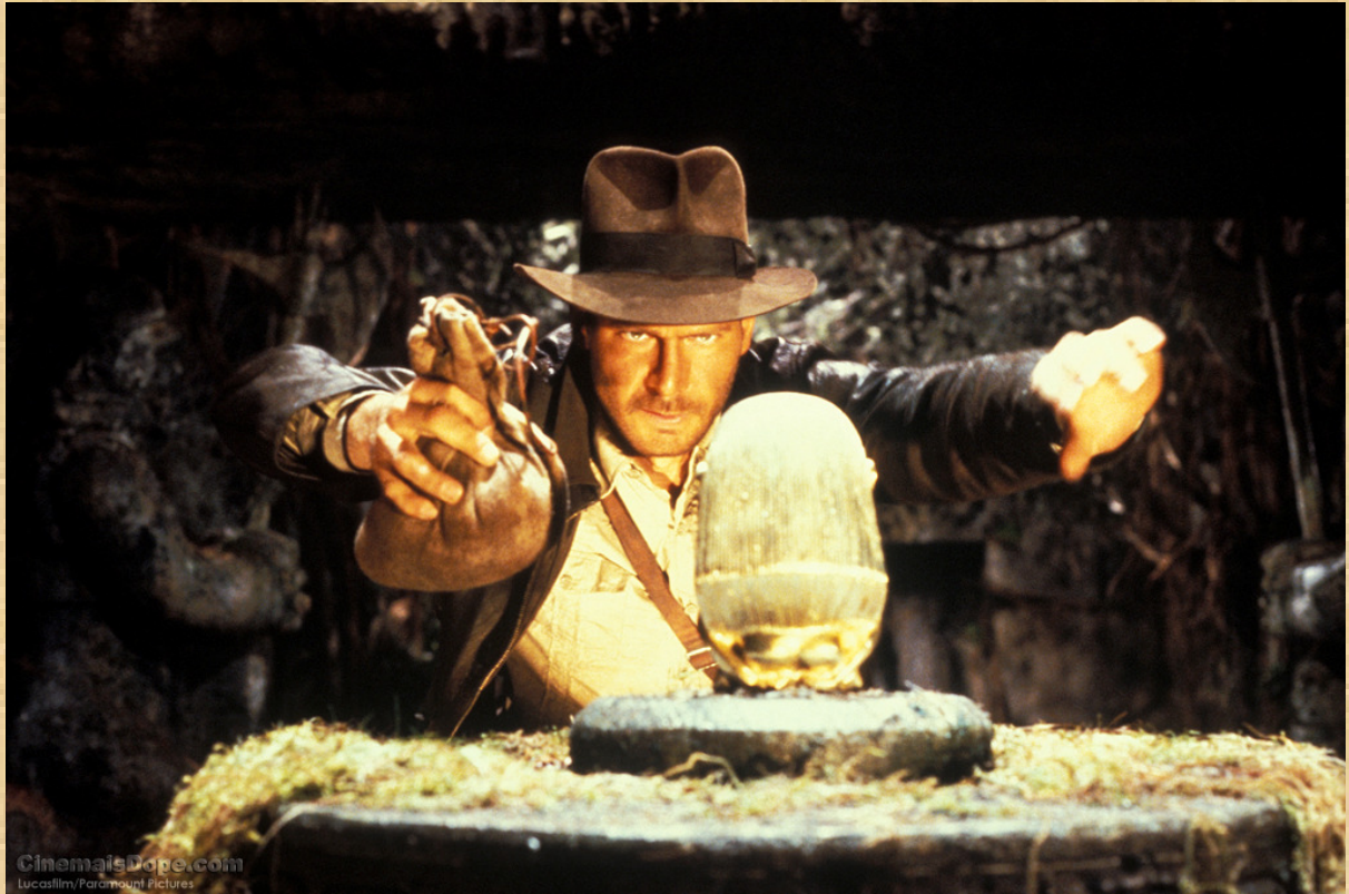
Figure 3 - Take extreme care when retrieving artefacts