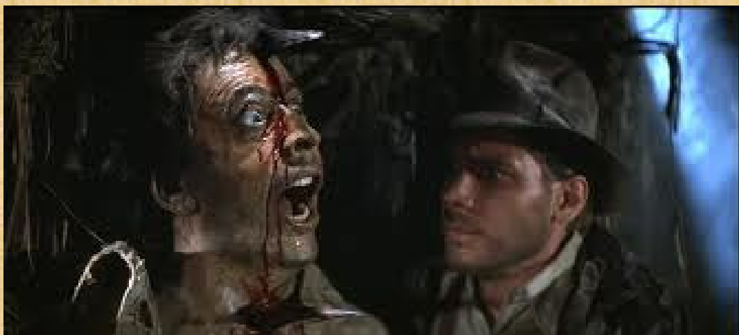
Figure 2 - Keep out of the light. If it's dark inside, keep it dark!