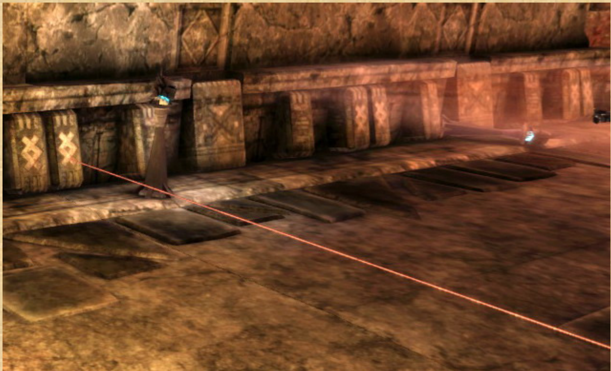
Figure 1 - Do not trip on these!