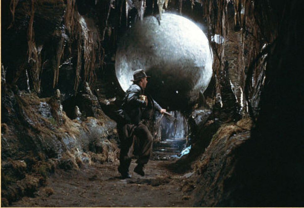
Figure 5 - This is bad!!