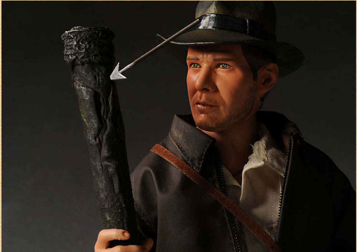
Figure 7 - Like today, sometimes these things fly at you from nowhere!