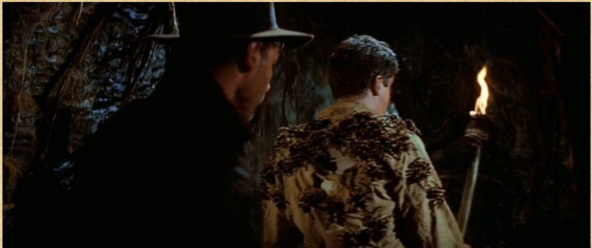
Figure 6 - Biological hazards are commonplace